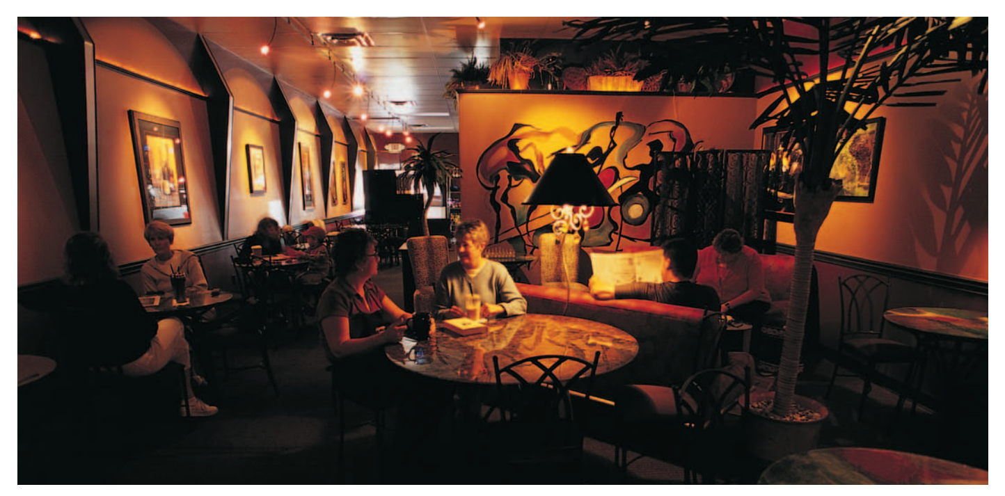
At-once upscale and affordable, The Espresso Gallery is a great way to wind down the day. Or to begin one, for that matter.