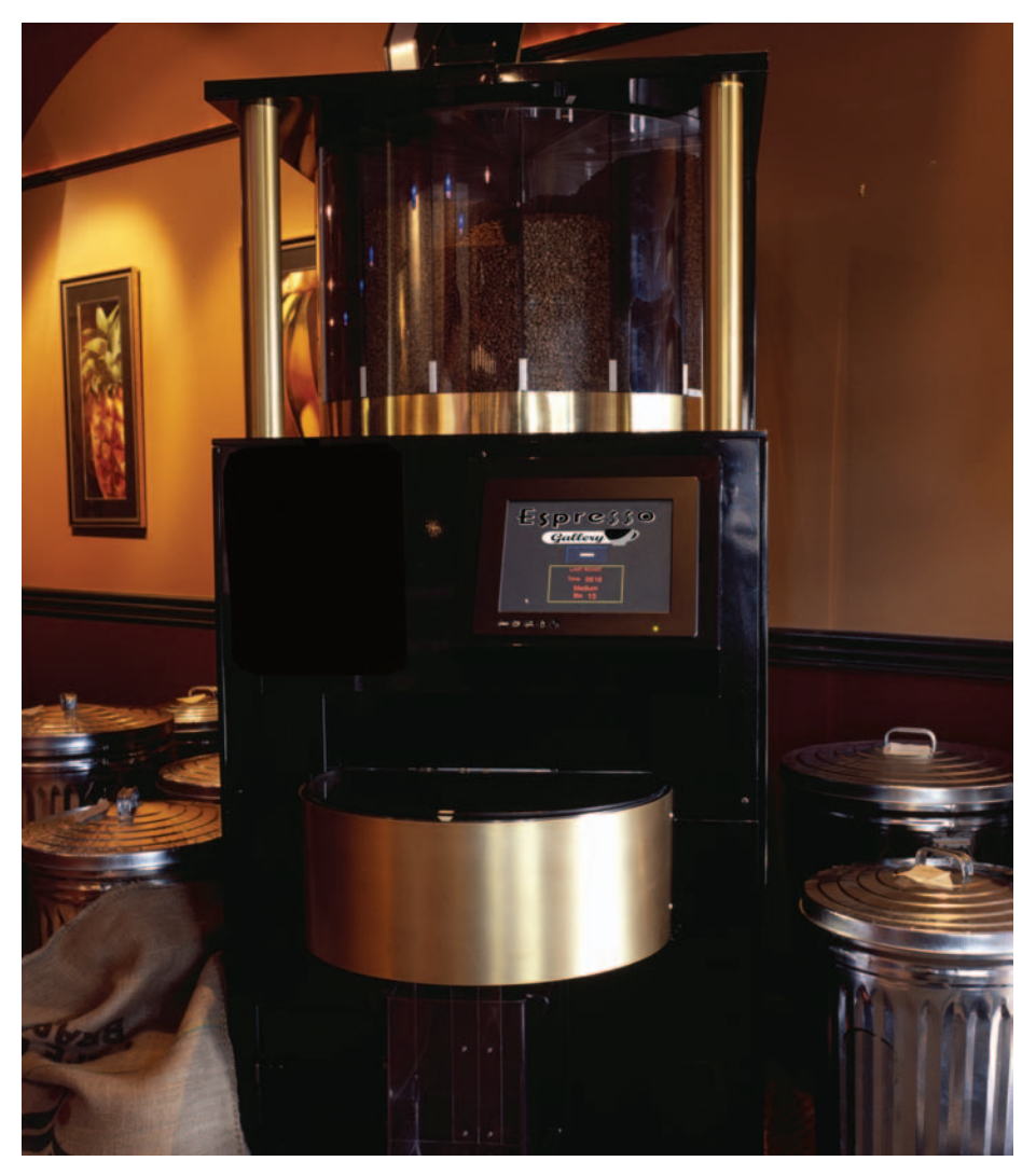
The space-age meets the humble coffee bean at the Espresso Gallery, where Hubble telescope technology ensures that each bag is roasted to perfection.

Teens come in before school, after school and on weekends. Soccer moms gather and chat after they get their kids off to school. Ladies of a certain age visit in the afternoons. Classmates stop by together after sessions at the nearby yoga center. And thanks to Espresso Gallery's new DSL ports and wireless Internet access, business people come in all day for small meetings or to con-