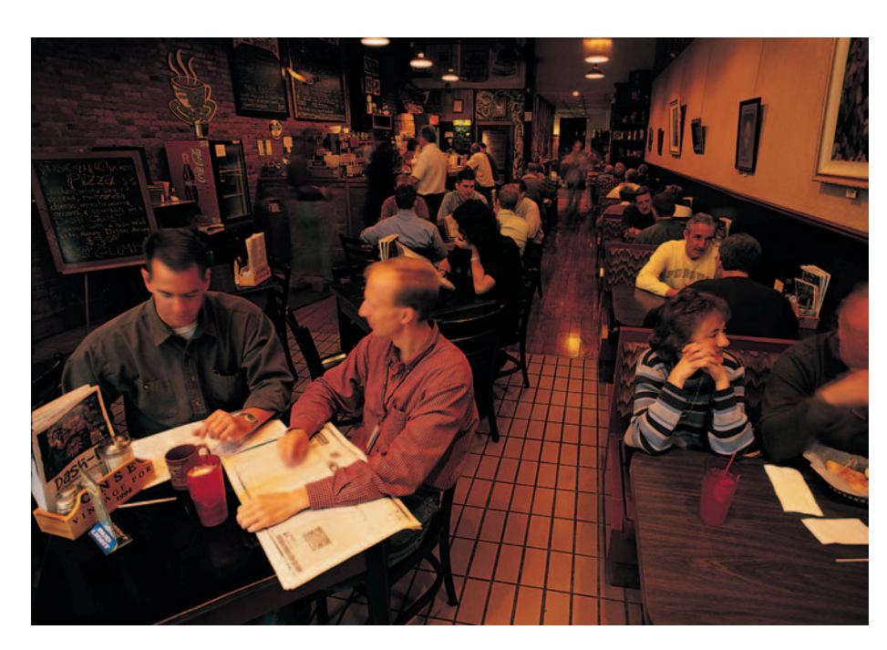
Lunch at the Dash-In is a preferred downtown gathering spot for many.

The Dash-In's full menu makes it the hot spot midday. "We see a lot of business taking place at the tables dur-