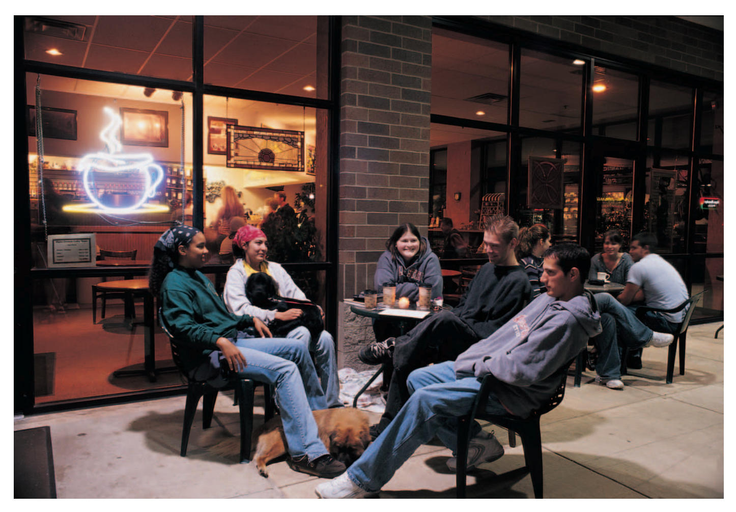
Youth is served at the Higher Grounds, where a cuppa' joe, a brisk autumn eve and good friends come to meet.