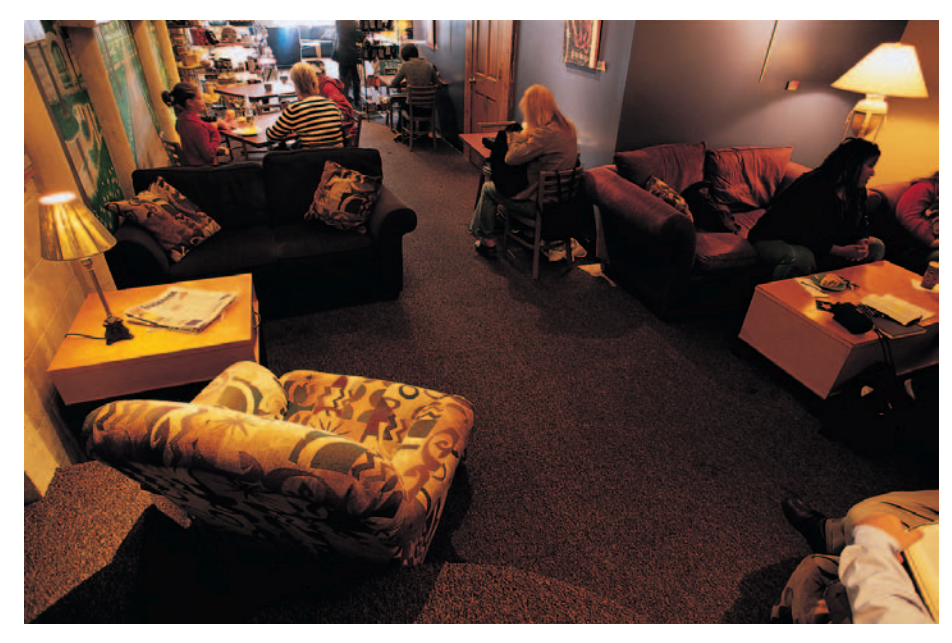
There's a cozy, artsy appeal to the Firefly, where local artists display and sell their work.